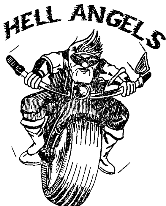
19270 —Textile garments