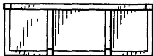
-Elevation of other end-