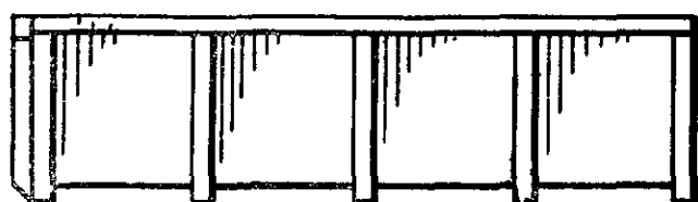
-Elevation of other side-