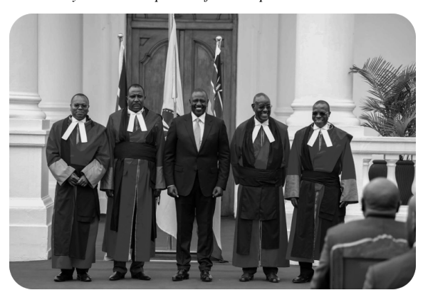
Figure 8: H.E the President with newly appointed Court of Appeal Judges

Article 10(2)(a): Patriotism, National Unity, the Rule of Law, Democracy and Participation of the People