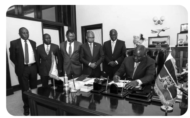
Figure 3: H.E. the President signing the County Government Allocations Bill 2022