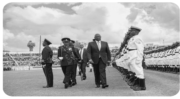
Figure 2: H.E. the President during the 58th Jamhuri Day Celebrations, 2022

Article 10(2)(a):Patriotism, National Unity, the Rule of Law, Democracy and Participation of the People