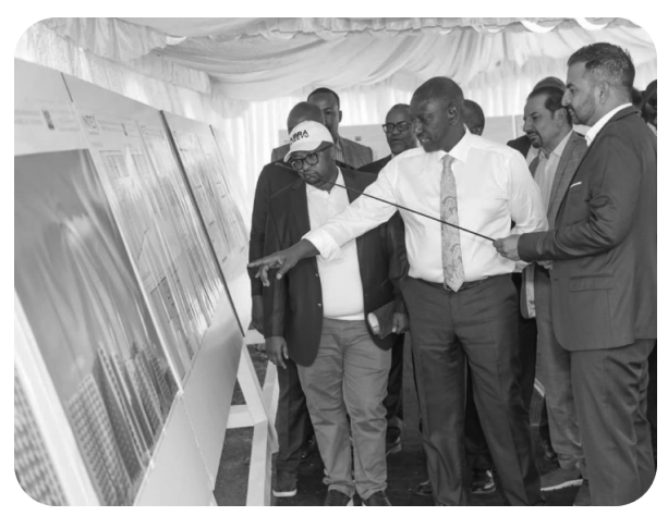
Figure 4: H.E. the President launching the Kibera-Soweto East Phase B housing project