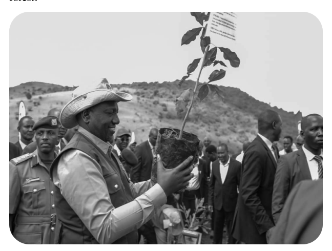
Figure 6: H.E. the President launching the Accelerated Forestry and Rangelands Restoration Programme

898. H.E. the President on 7th November, 2022 attended the UN Climate Change Conference (COP27) in Sharm El-Sheikh, Egypt. During the conference, the President was elected Chairperson of the Committee of African Heads of State and Government on Climate Change and made commitments towards mitigation, adaptation, and mobilisation of increased financial flows to people affected by climate change in Africa. Further, H.E. the President on 21st December, 2022 presided over the launch of the National Programme for Accelerated Forestry and Rangelands Restoration targeting to plant 15 billion trees by 2032 where 180,000 tree seedlings were planted at Ngong Hills forest.