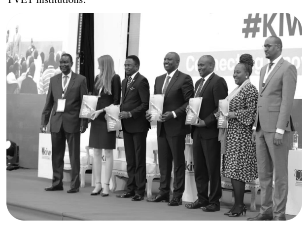
Figure 7: H.E. the President launching the Kenya Innovation Week

901. H.E. the President on 8th December, 2022 launched the Kenya Innovation Week Expo at Sarit Centre themed Innovation for Transformation and Impact in the Society to strengthen research and commercialization practices for greater socio-economic impact. H.E the President on 6th December, 2022 also launched the Digital Economy Enablement Programme at Kabete National Polytechnic with the aim of providing 100,000km of fibre optic cable connecting 29,000 shopping centres to internet and availing 20,000 gadgets to 240 TVET institutions.