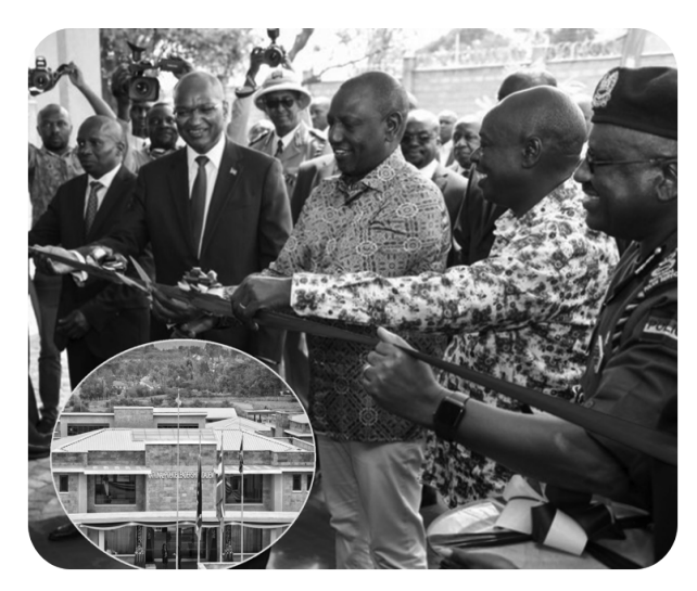
Figure 5: H.E the President launching the National Police Service Leadership Academy in Ngong

policy, administrative, institutional and operational constraints on effective service delivery by NPS to review and recommend improvements of the terms and conditions of service for NPS, Prison Service and National Youth Service. H.E. the President on 21st December, 2022 also launched the National Police Service Leadership Academy in Ngong, Kajiado County to impart leadership skills and expertise that will boost professionalism in the police service.