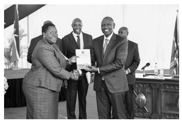
Figure 9: H.E the President receiving the report on Education Reforms

1162. To enhance social justice through access to quality education, H.E. the President on 1st August 2023 received a report from the Presidential Working Party on Educational Reforms. The Report recommended among others: the new system to inculcate innovation and facilitate learners to explore their talents; and the Ministry of Education to develop guidelines for accelerated education programmes for marginalised groups, learners with special needs and adult and continuing education, to enhance equitable access and inclusion. The Report also recommended reducing of subjects from pre-primary to Junior Secondary School to reduce the work load on learners.