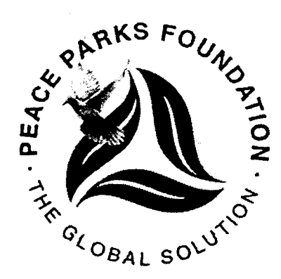
FILED: 2 NOVEMBER 2000

Address for service: ADAMS & ADAMS, 5th Floor, Namdeb Centre, 10 Bülow Street, Windhoek, Namibia.