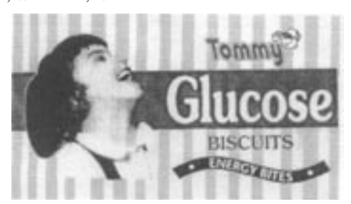
FILED: 11 November 2002

Address for service: GALGUT & GALGUT, c/o HARMSE ATTORNEYS, 21 Nachtichal Street, Palm Crescent Building 3/201, Windhoek, Namibia.