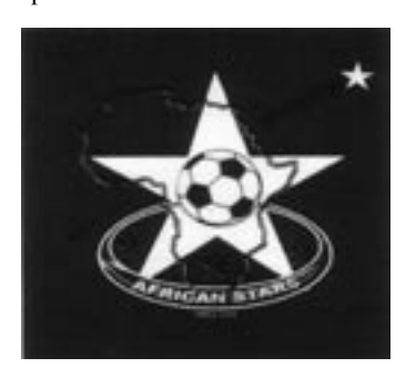
FILED: 2 February 2009

Address for service: AFRICAN STARS FC, P.O. Box 27498, Windhoek, Republic of Namibia.