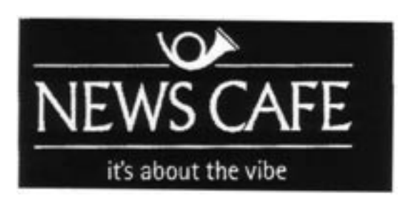
FILED: 25 April 2006

Registration of this trade mark shall give no right to the exclusive use of the words "NEWS" and "VIBE" separately and apart from the mark.