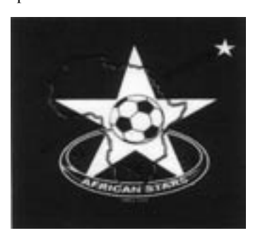
FILED: 2 February 2009

Address for service: AFRICAN STARS FC, P.O. Box 27498, Windhoek, Republic of Namibia.