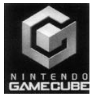
FILED: 8 November 2002

Address for service: DR WEDER, KAUTA & HOVEKA INC, PO Box 864, Windhoek, Namibia.