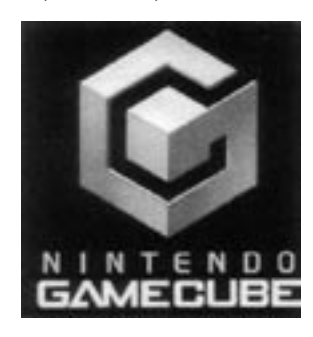
FILED: 8 November 2002

resistance wires; cinematographic films; slide films; slide film mounts; pre-recorded video disks and tapes; vending machines; cash registers; coin counting and sorting machines; drawing or drafting machines; electric calculators; calculating scales; inflatable swimming floats; flutter boards, in the name of NINTENDO CO., LTD . incorporated in Japan of 11-1, Hokotate-cho, Kamitoba, Minami-ku, Kyoto-shi, Kyoto, Japan. Address for service: DR WEDER, KAUTA & HOVEKA INC, PO Box 864, Windhoek, Namibia.