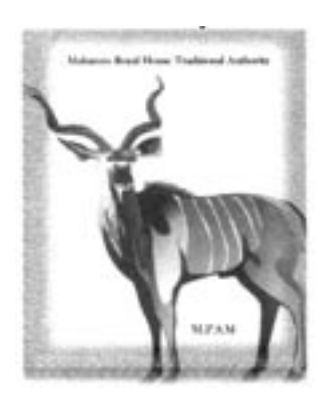
FILED: 5 May 2009

2009/0384 in class 25: Clothing, footwear and headgear in the name of MAHARERO ROYAL HOUSE TRADITIONAL AUTHORITY , House No. 37, Otjinene Settlement. Address for service: MAHARERO ROYAL HOUSE TRADITIONAL AUTHORITY, P.O. Box 45, Otjinene, Omaheke Region, Republic of Namibia.