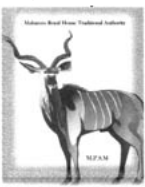
FILED: 5 May 2009

Address for service: MAHARERO ROYAL HOUSE TRA-DITIONAL AUTHORITY, P.O. Box 45, Otjinene, Omaheke Region, Republic of Namibia.