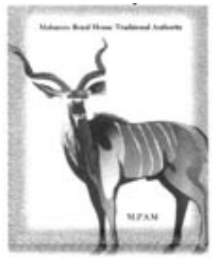
FILED: 5 May 2009

Address for service: MAHARERO ROYAL HOUSE TRA-DITIONAL AUTHORITY, P.O. Box 45, Otjinene, Omaheke Region, Republic of Namibia.