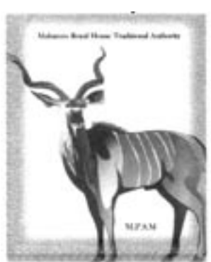
FILED: 5 May 2009

the name of MAHARERO ROYAL HOUSE TRADITION- AL AUTHORITY, House No. 37, Otjinene Settlement. Address for service: MAHARERO ROYAL HOUSE TRADITIONAL AUTHORITY, P.O. Box 45, Otjinene, Omaheke Region, Republic of Namibia.