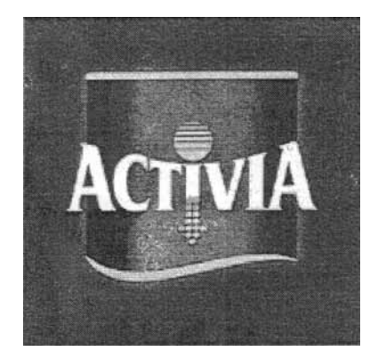
FILED: 22 December 2005

Address for service: ADAMS & ADAMS, c/o 12 Love Street, Windhoek, Namibia.