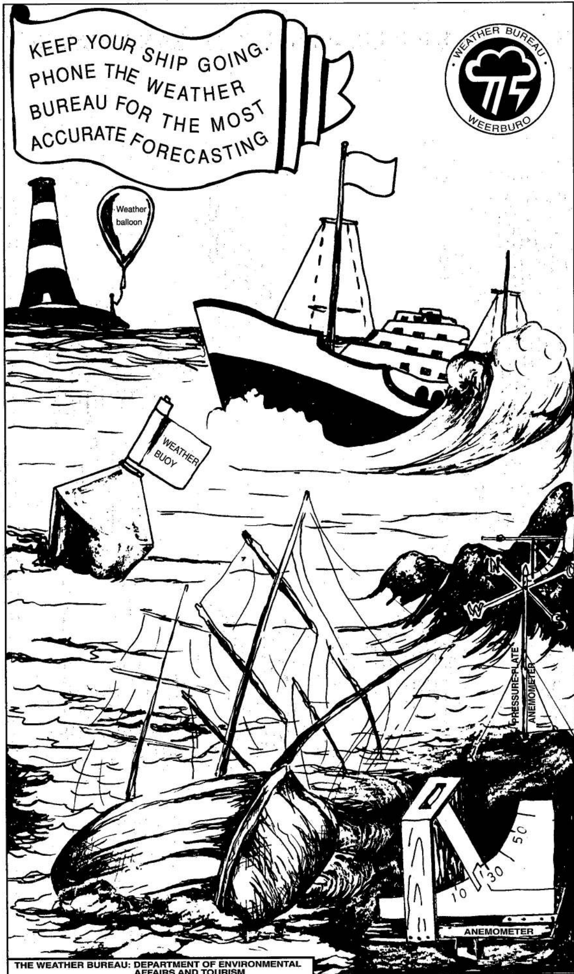
THE WEATHER BUREAU: DEPARTMENT OF ENVIRONMENTAL AFFAIRS AND TOURISM