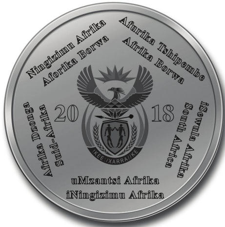
Obverse: R2 Crown (1 oz, Ag 925 Cu 75)