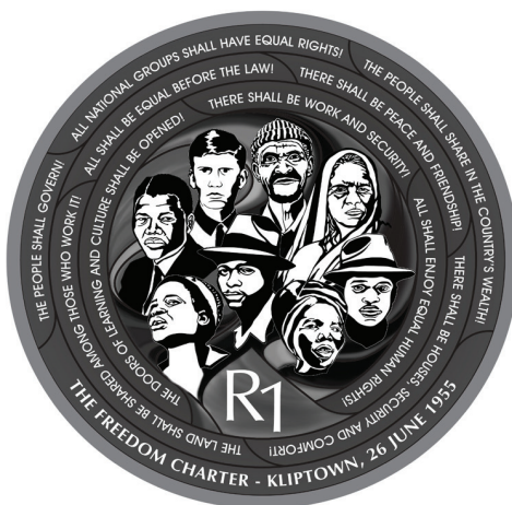
Reverse: R1 (Ag 925 Cu 75)