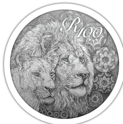
Reverse: R100 (1/2 oz, Au 999.9)