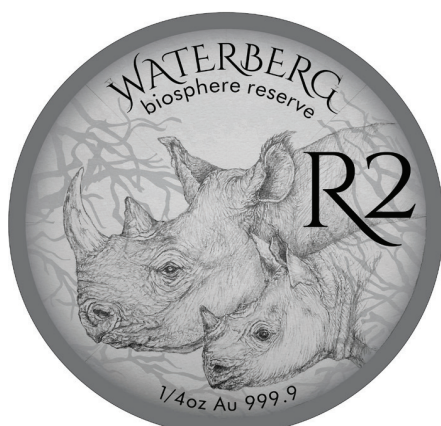
Reverse: R2 (1/4 oz, Au 999.9)