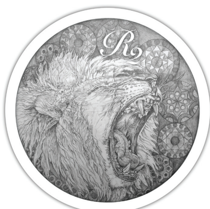
Reverse: R2 (1 oz, sterling-silver)