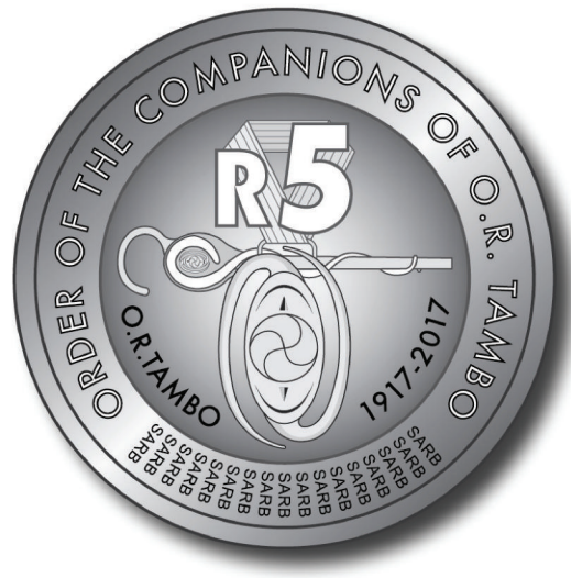
Reverse: 2017 R5 Circulation Coin