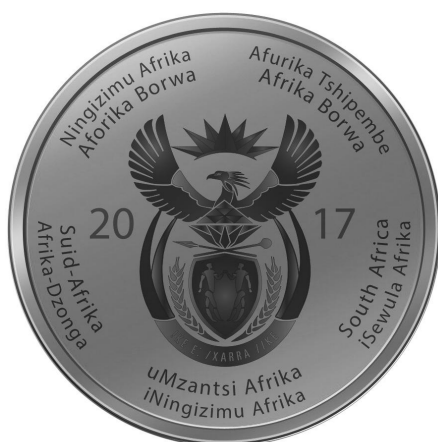
Obverse: R50 (1 oz, Ag 925 Cu 75)