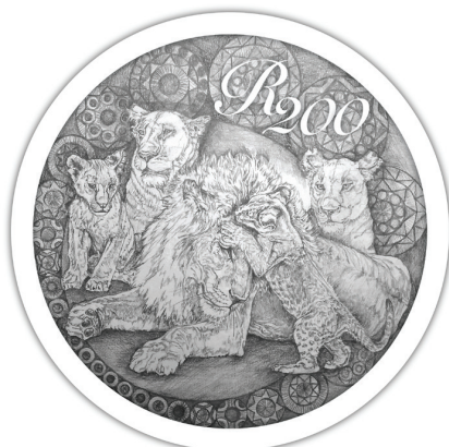
Reverse: R200 (1 oz, Au 999.9)