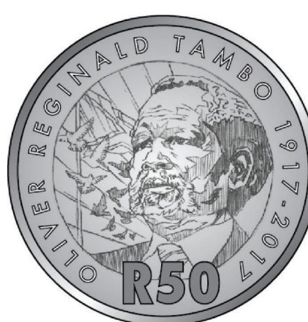
Reverse: R50 (Base metal alloy)