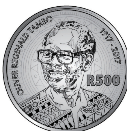
Reverse: R500 (1 oz, Au 999.9)