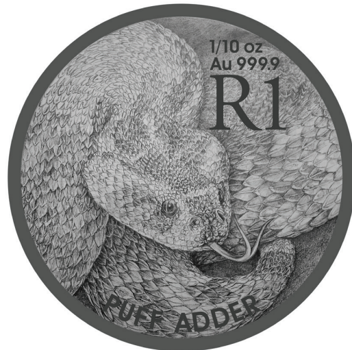
Reverse: R1 (1/10 oz) (Au 999.9)