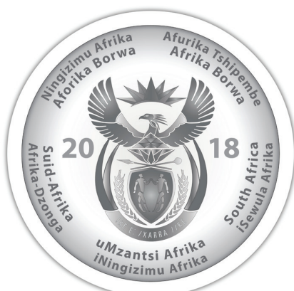
Obverse: R2 (1 oz, sterling-silver)