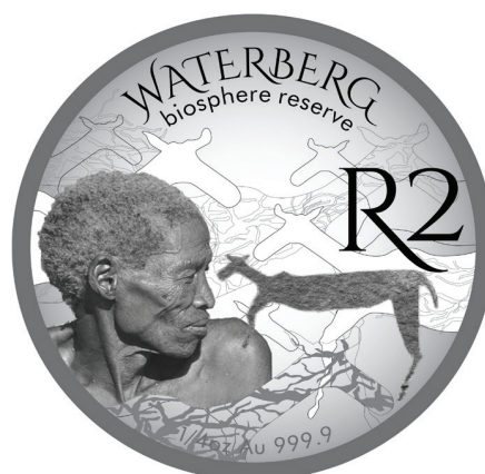
Reverse: R2 (1/4 oz, Au 999.9)