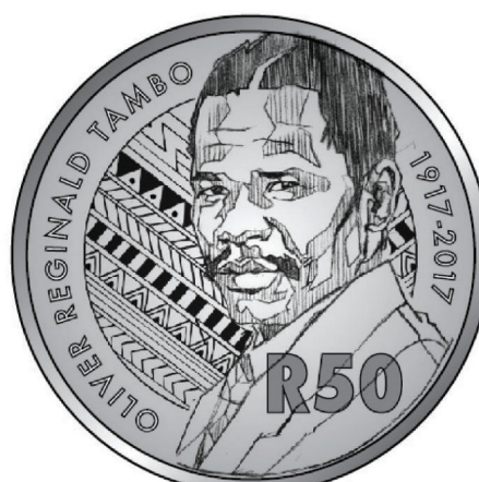
Reverse: R50 (1 oz, Ag 925 Cu 75)