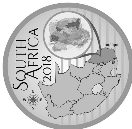
Common obverse (2x R2, 1/4 oz and 2x R2,1 oz)