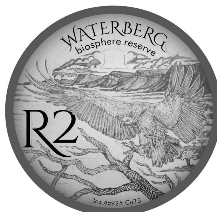
Reverse: R2 (1 oz, Ag 925 Cu75)