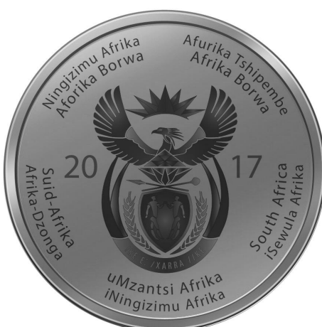
Obverse: R50 (1 oz, Ag 925 Cu 75)