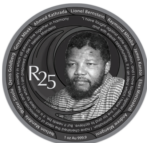
Reverse: R25 (1 oz, Au 999.9)