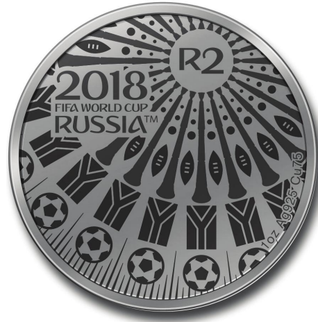
Reverse: R2 Crown (1 oz, Ag 925 Cu 75)