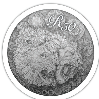
Reverse: R50 (1/4 oz, Au 999.9)