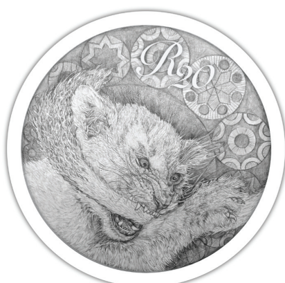
Reverse: R20 (1/10 oz, Au 999.9)