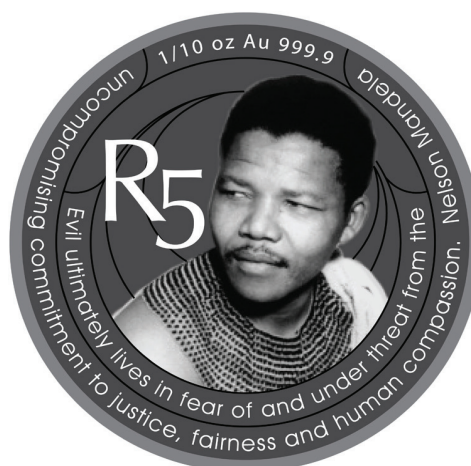
Reverse: R5 (1/10 oz, Au 999.9)