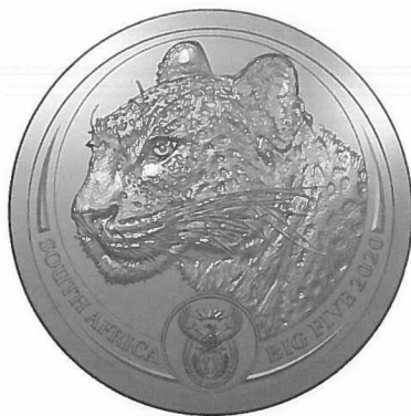
Obverse: R5 (1oz, Ag 999)

We would like to inform you that an error was published in the government gazette of 22 March 2019. The description below the coin designs of the 'Africa's Big 5' platinum series feature R50 as the denomination. The denomination for the platinum range is R20 or TWENTY RAND as featured on the coins.