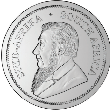
Obverse: R2 (2oz, Ag 999)