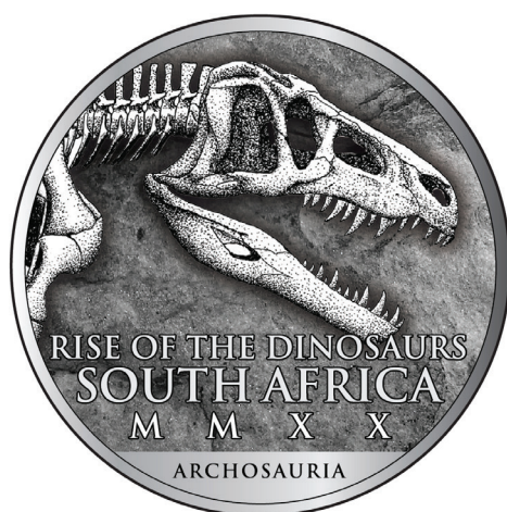
Obverse: R25 (1oz, Ag 999)