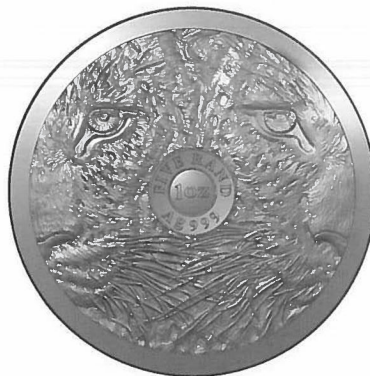
Reverse: R5 (1oz, Ag 999)