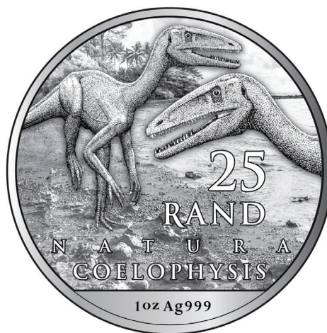
Reverse: R25 (1oz, Ag 999)