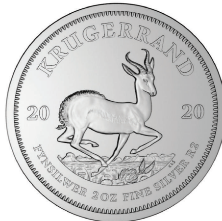
Reverse: R2 (2oz, Ag 999)