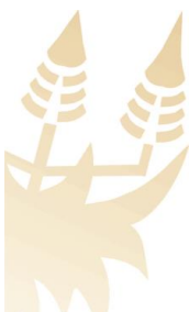
HON. HELEN SAULS-AUGUST (MPL) SPEAKER: EC PROVINCIAL LEGISLATURE

A handwritten signature in black ink, appearing to read 'H. Sauls-August'.