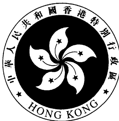
Figure 2 The Design of the Regional Emblem of the Hong Kong Special Administrative Region of the People's Republic of China