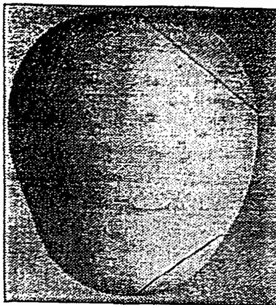
Level cut Platsnit